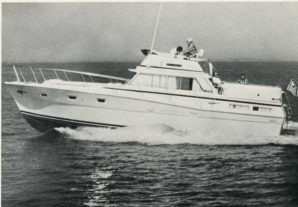
The appearance of the Viking 43 in profile is quite innovative from its very restrained clipper bow to the after cabin trunk which extends the full beam of the yacht. The deckhouse, though not overly high in itself, is set on a very extensive trunk, giving an attractive look and contributing to the feeling of spaciousness below.

Forward of the salon, neatly railed off and dropped three steps, is a most convenient dinette to port and galley area to starboard. The dinette itself is very open and light, seats six, and converts to a double berth. The galley is U-shaped, fully equipped, and fitted with convenient stowage for associated gear. Yet another large locker space opens forward off the dinette. The three-hatch foredeck arrangement provides separate opening hatches for the dinette and galley areas, and located as they are on top of that amply high